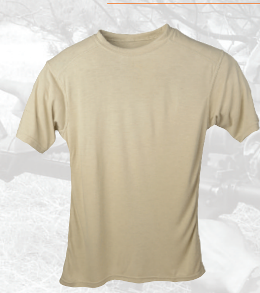
A11C100 FR2 Short Sleeve Crew Color: desert sand. Also available in tan 499, coyote brown or black. Sizes: S-2XL